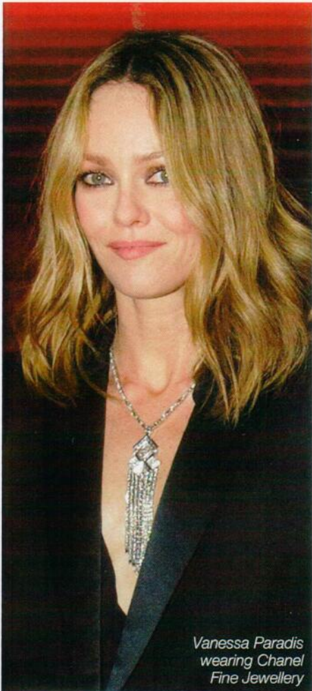
Vanessa Paradis wearing Chanel Fine Jewellery