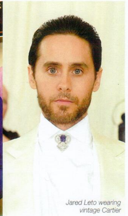
Jared Leto wearing vintage Cartier