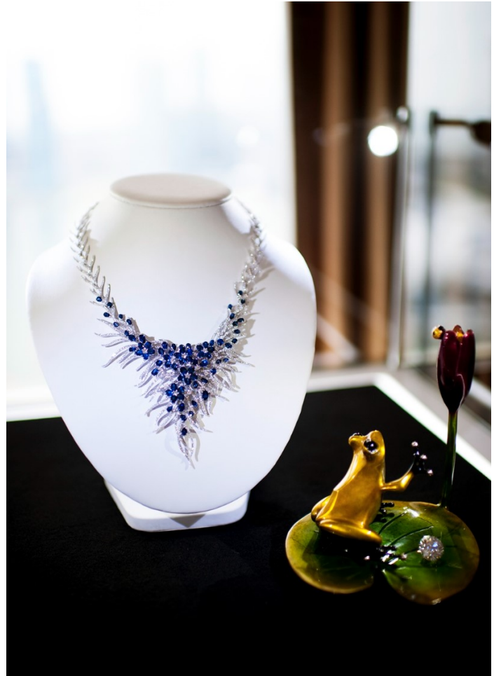
A look at some of the exquisite gemstones and unique jewelry pieces carried by Genesis-Global

Aditus, the world's no. 1 luxury access platform for crypto-affluents, announced a strategic partnership with Genesis-Global Gems & Jewellery Group ("Genesis-Global"), an ultra-luxury jewellery group based in Singapore and Hong Kong. As part of the agreement, Aditus will implement Aditus Pay as a crypto-currency solution for Genesis-Global in Singapore to serve clients who wish to make payment for precious gemstones, such as investment-grade diamonds, rare rubies and sapphires and other precious stones, as well as haute jewellery, using crypto-currencies.